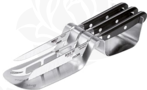
Breakfast set Art.-Nr.: 80192003